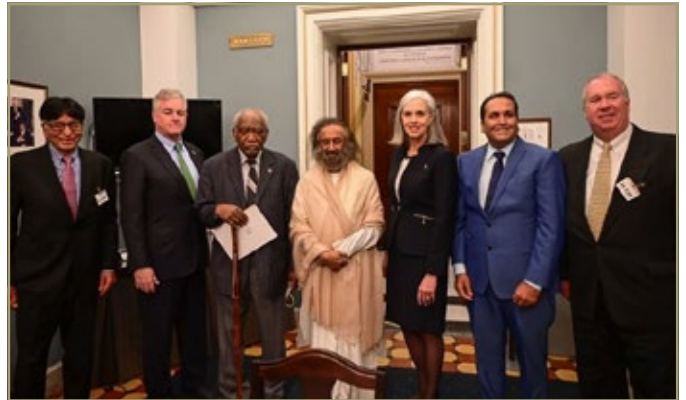
Reception at the US Capitol hosted by Assistant Speaker of the U.S. House of Representatives Katherine Clark, Congressman Raja Krishnamoorthi and Congressman Danny K. Davis | May 12