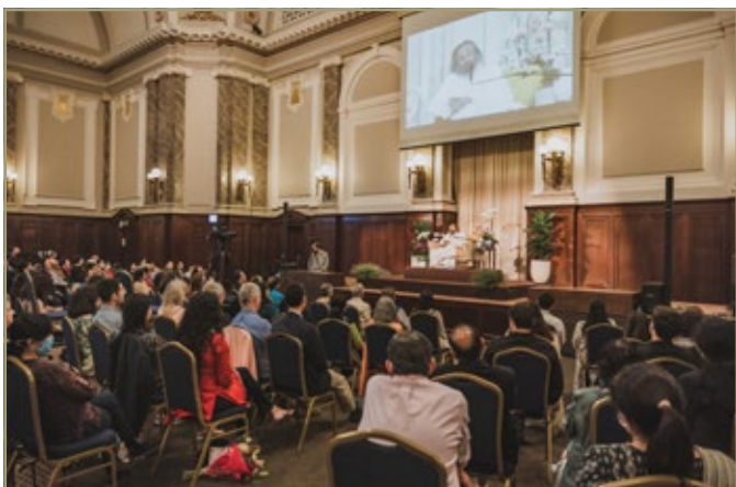
Conversation with physicians on rethinking the path to wellness | June 3