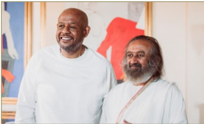
A fireside chat with Forest Whitaker | June 24