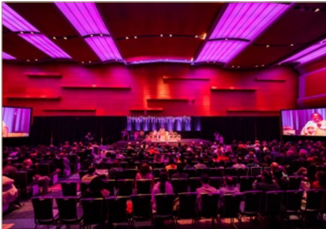
Interaction with Hampton Roads community at Virginia Beach 'I Stand For Peace' event | November 18