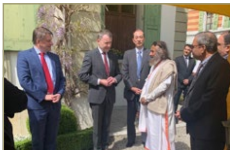
Gurudev meets Excellencies from the Permanent Mission in Geneva