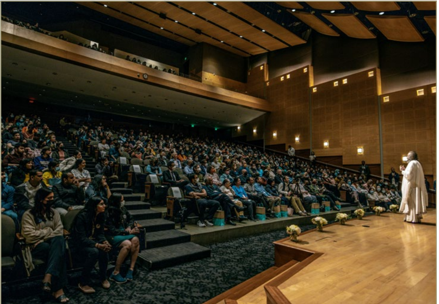
Addressing students and faculties of several universities hosted by the University of Washington, Seattle on Finding Calm in Chaos | June 18