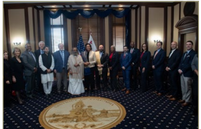
Discussion on the value of diversity and the role of culture in transcending divides with Washington, DC Mayor, Muriel Bowser | November 17