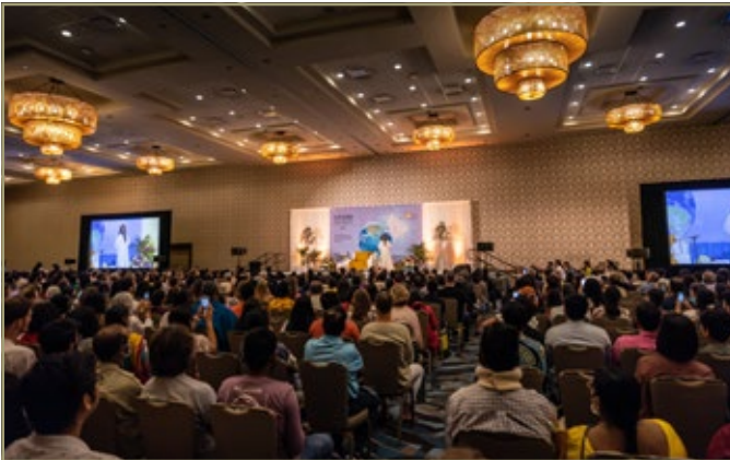
A celebration for peace and a pledge | May 20