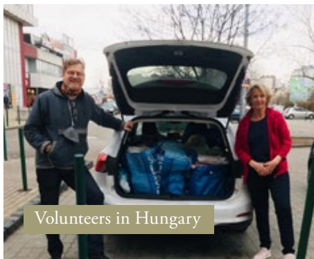
Volunteers in Hungary

"PM @narendramodi played a commendable role in keeping good relations with both countries. India's neutral stance & tradition of non-violence make it uniquely poised to participate in the #UkraineRussia talks. @DrSJaisankar (1/2)