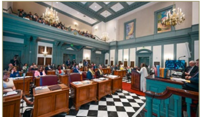
Addressing the Delaware State Senate and the House of Representatives | May 10