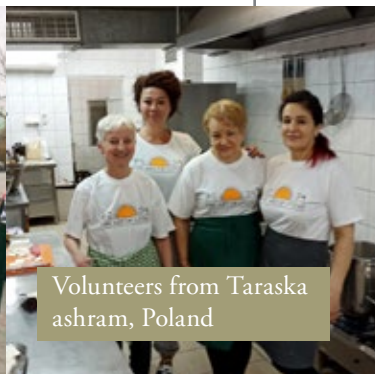
Volunteers from Taraska ashram, Poland