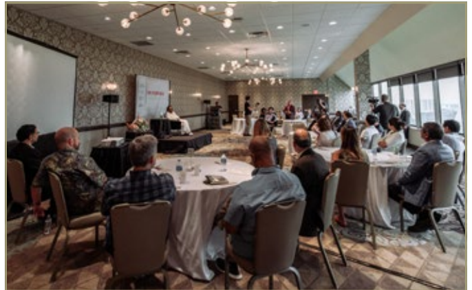
CEOs | May 20