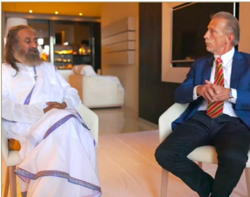
"You can stop this war" said the German Premiere League soccer club manager and former player, Christoph Daum in a conversation with Gurudev in Warsaw Poland | April 23