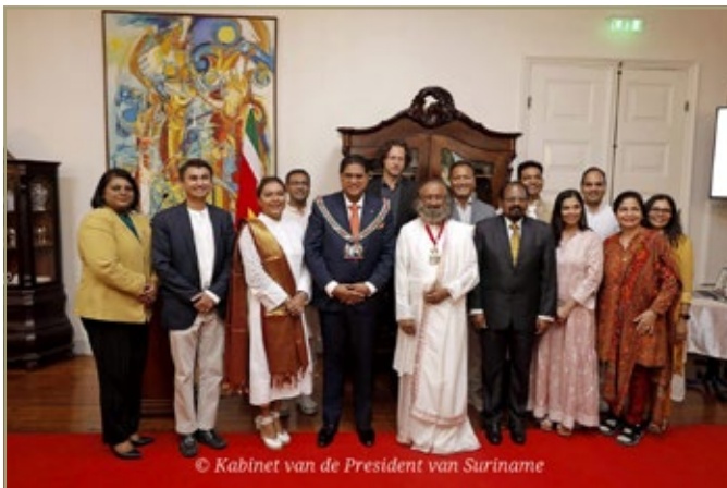
Gurudev honored with the highest civilian award of Suriname by President Santokhi | July 14