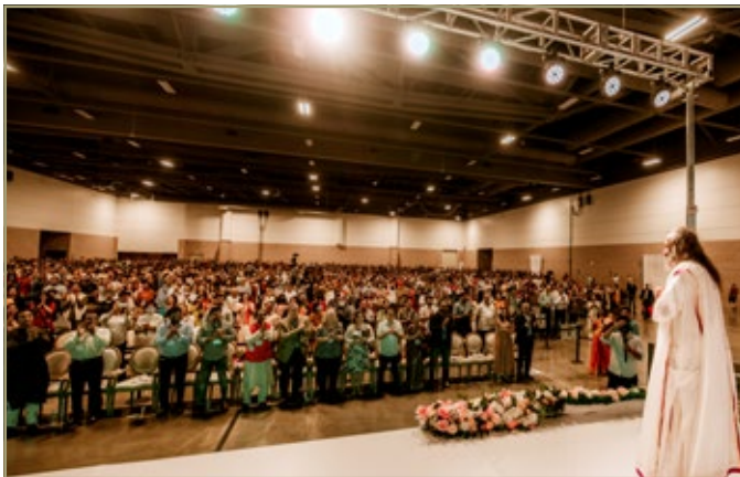
Thousands affirmed their commitment to peace in one of the most diverse cities of the US | May 19