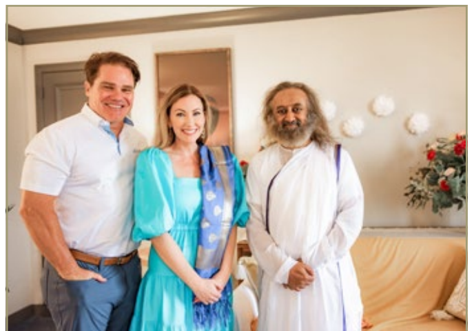
Stephanie Hollman TV Personality | May 19