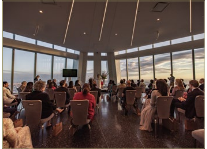
At the One World Observatory in Manhattan a meeting with various leaders, New Jersey, USA | May 9