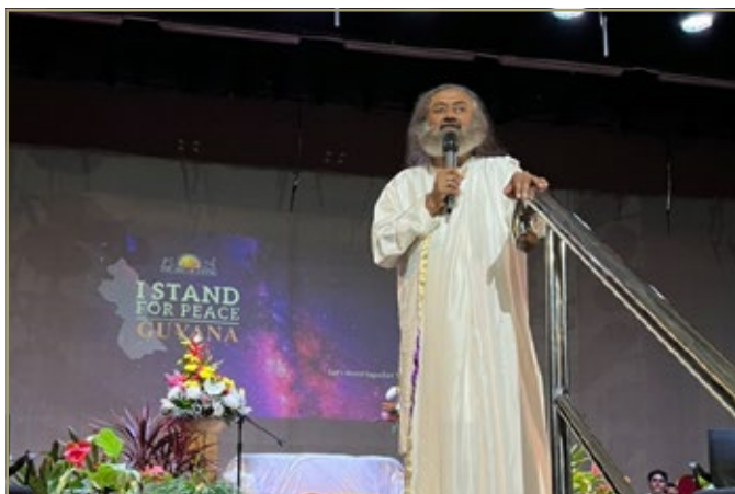
I Stand for Peace in Guyana was attended by thousand who meditated with Gurudev and pledged for peace | July 15