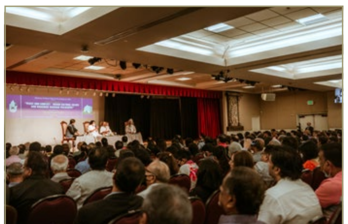
Leaders of the Jain community support I Stand for Peace | June 4