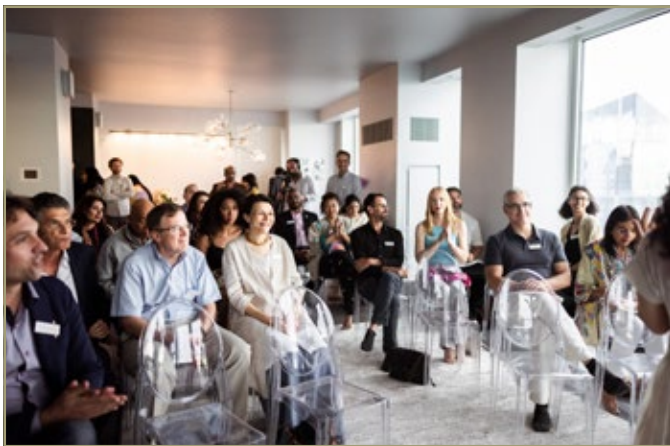
Interacting with business leaders and other prominent members of the civil society | June 23