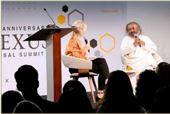
Addressing the next generation philanthropists, impact investors and social entrepreneurs on purpose and joy of giving back | June 25