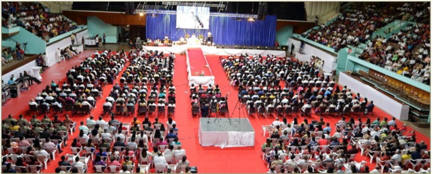
Thousands including the President of Suriname and members of Parliament joined Gurudev in his tour for world peace | July 14