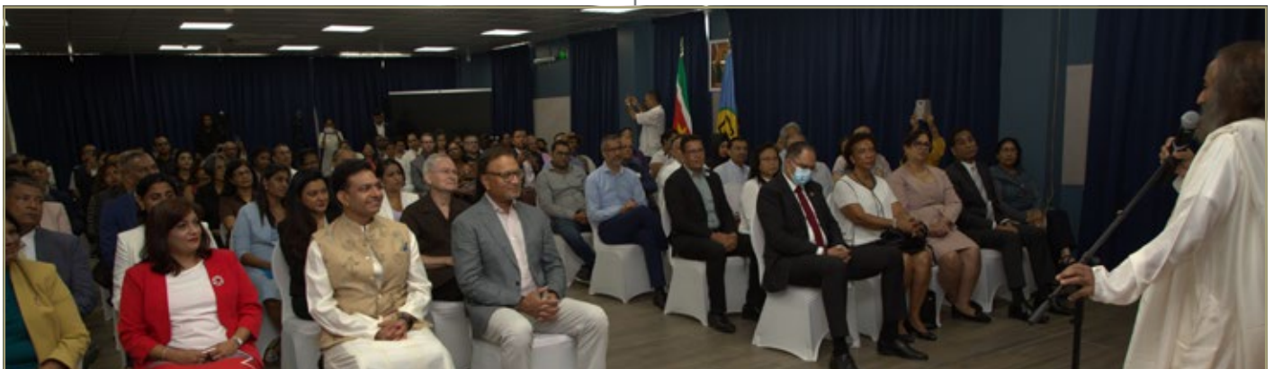
Addressing the business leaders | July 14