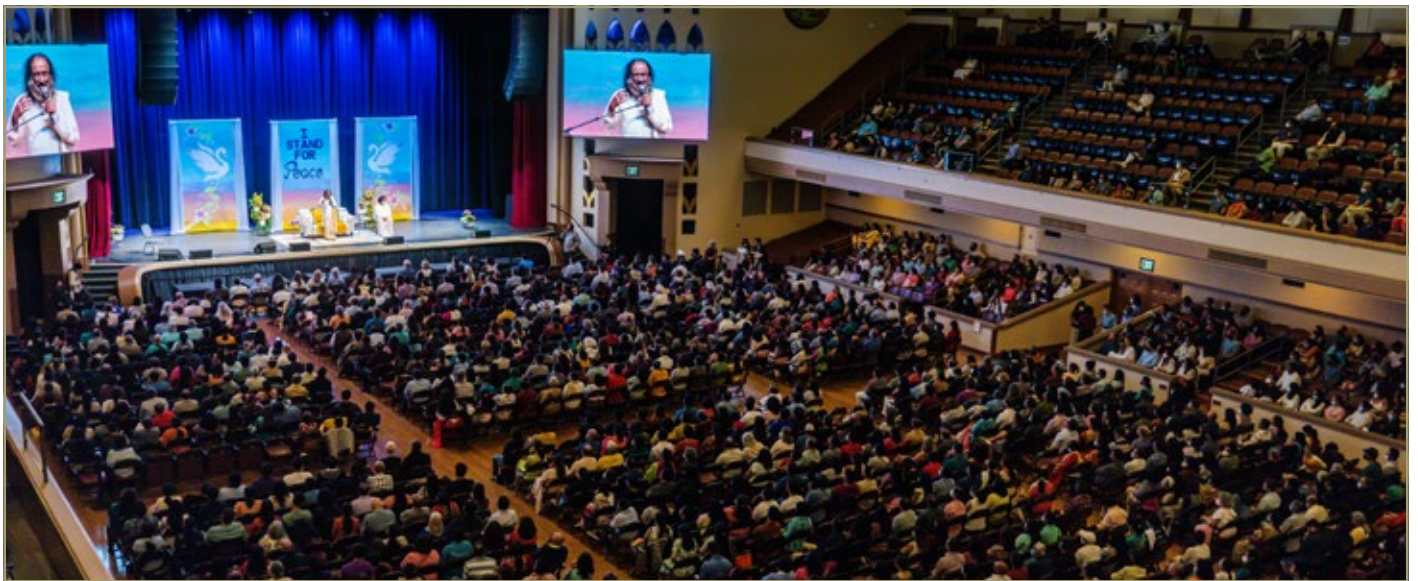
San Francisco Bay Area residents support "I Stand for Peace" | June 9