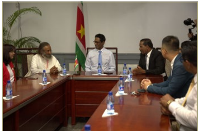
Interaction with the Speaker and members of Parliament at the National Assembly | July 14