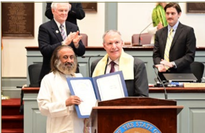
Each chamber presented a tribute recognizing Art of Living's work | May 10