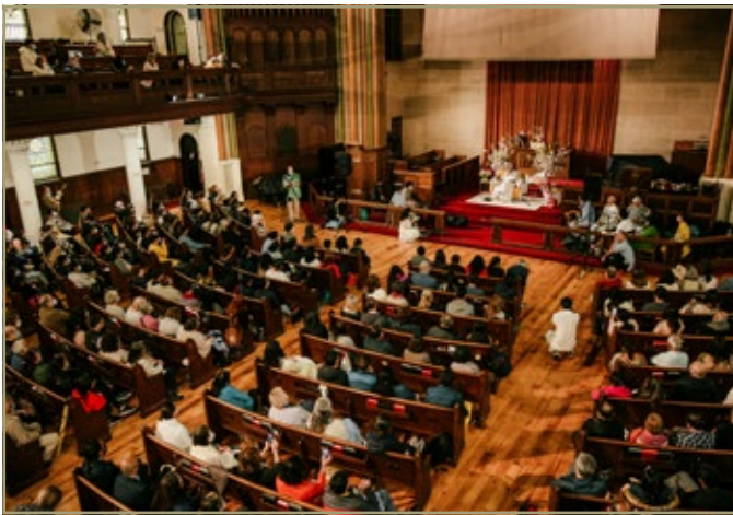
Hundreds join Gurudev at the St. Paul & St. Andrew United Methodist Church in New York, NY, USA | May 4