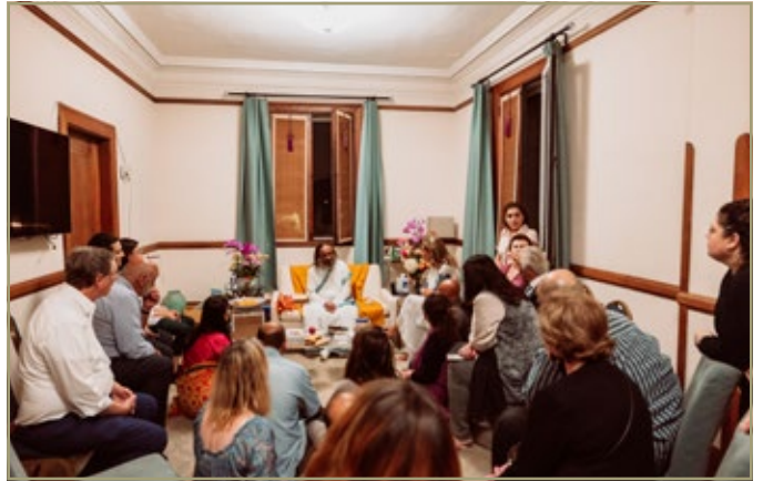
Meetings with society leaders | June 15