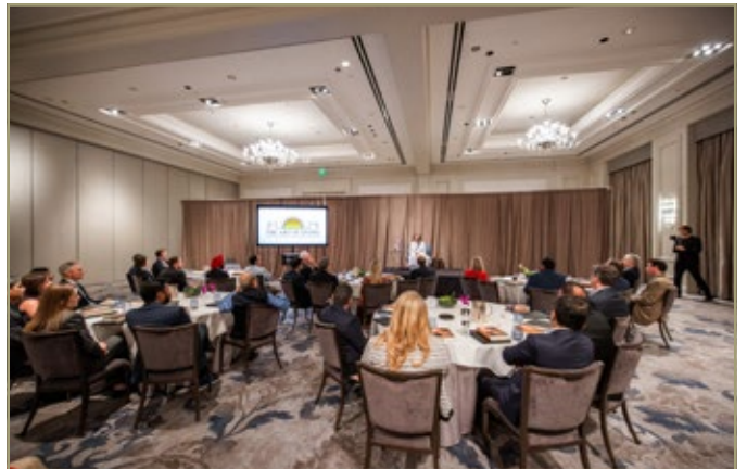
Business leaders and entrepreneurs, USA | May 19