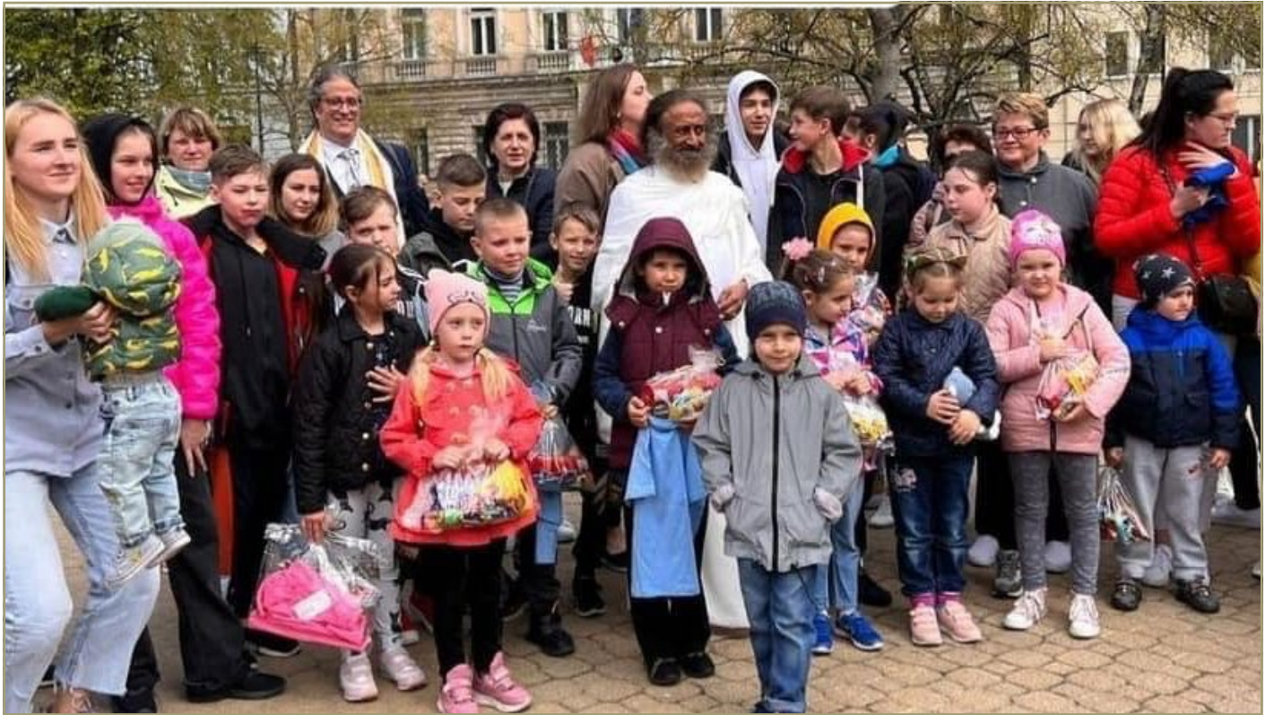
Gurudev leads a movement for peace a few hundred kilometres from the Ukrainian border | April 25