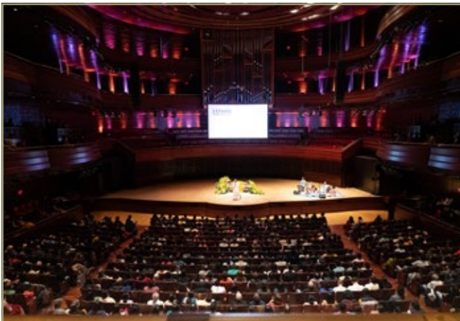
The I Stand For Peace movement at the Kimmel Centre, Philadelphia, PA, USA