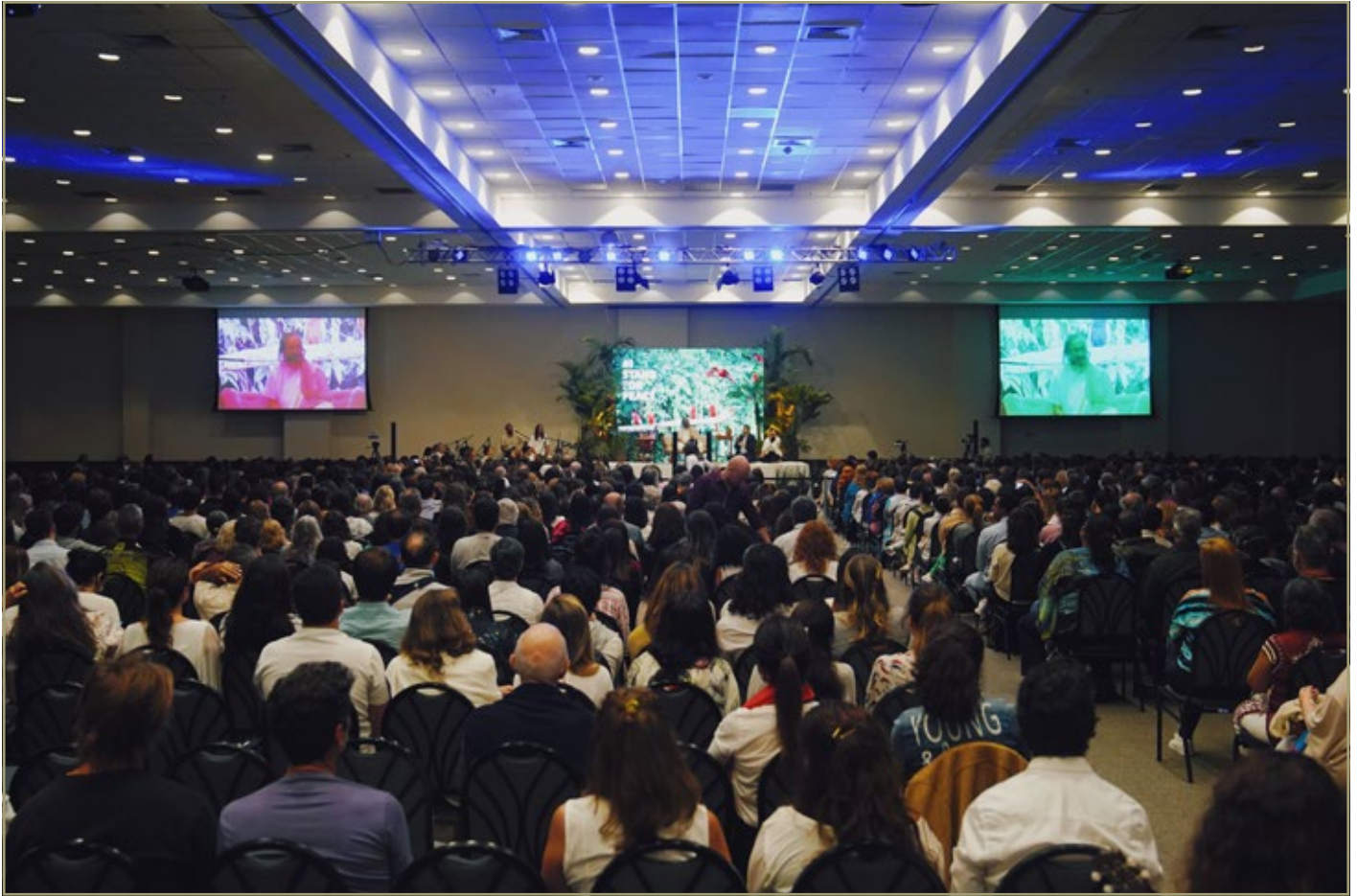
The “I Stand for Peace” tour continued to Brazil with more than 2500 people at the event in Rio de Janeiro | July 16