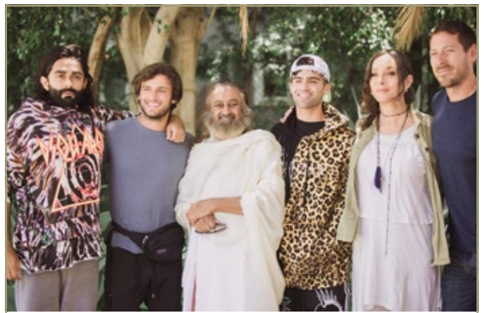
Gurudev shared his message through podcasts | June 2