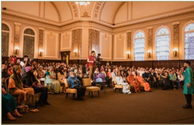
Celebrations and commitment for peace | June 15