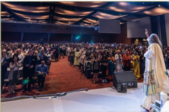
Residents of Greater Seattle area, Senators and Representatives of Washington state affirmed their commitment to peace | June 18