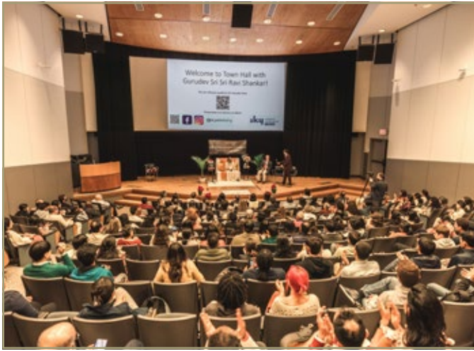
Addressing a Town Hall on Burnout in Academia and Healthcare at Emory University | November 11