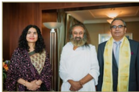
With H.E. Ambassador Indramani Pandey, Permanent Representative of India to the United Nations