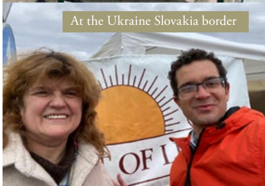
At the Ukraine Slovakia border