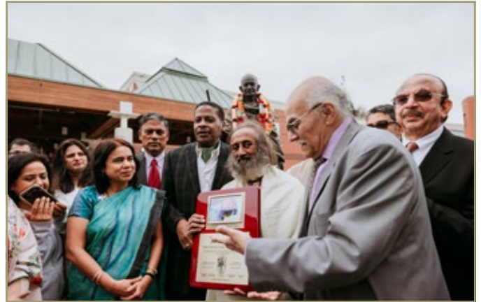
Gurudev being presented with the Gandhi Peace Pilgrim Award at the Dr. Martin Luther King Jr. National Historical Center in recognition of his efforts towards global peace | November 11