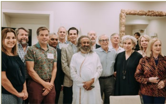
CEOs | May 19