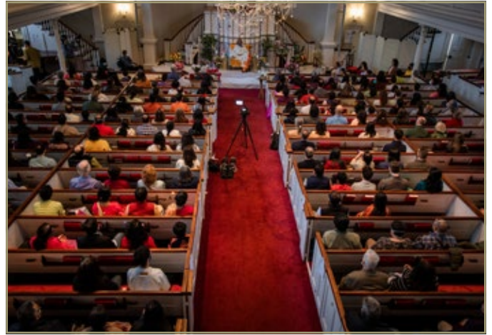
At the United Church of Christ in New Haven, CT, people from all walks of life take the pledge, New Haven, CT, USA | May 3