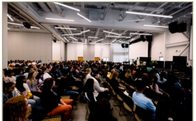
Addressing the students & faculty at Georgia Tech. University | November 9