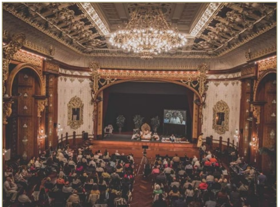
Hundreds stand up for peace in Interlagen, Switzerland with Gurudev