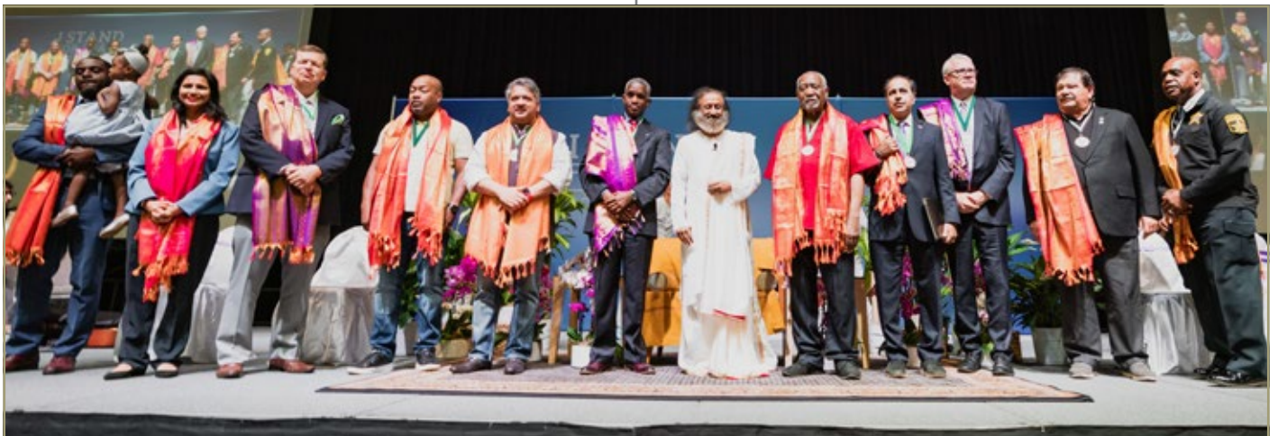
Interaction with thousands including prominent leaders of Chicago gathered at the University of Chicago Forum to find inner peace | June 26