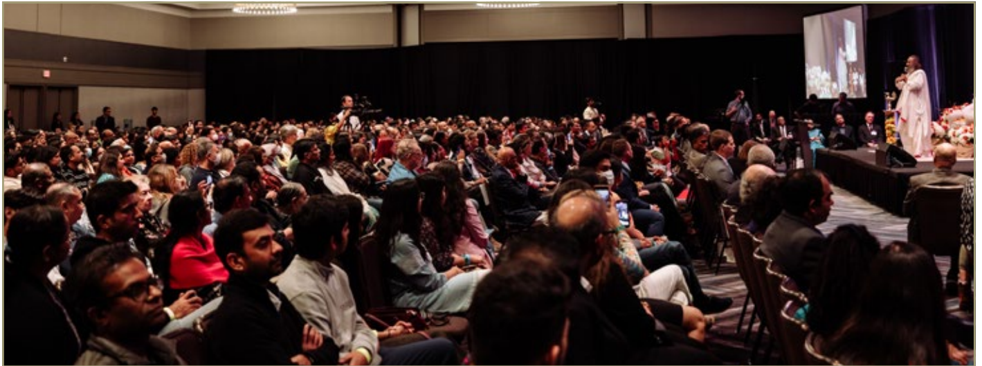
Reminding the gathering that peace begins from within & each one of us has the power to unite society when we stand up for peace | November 9