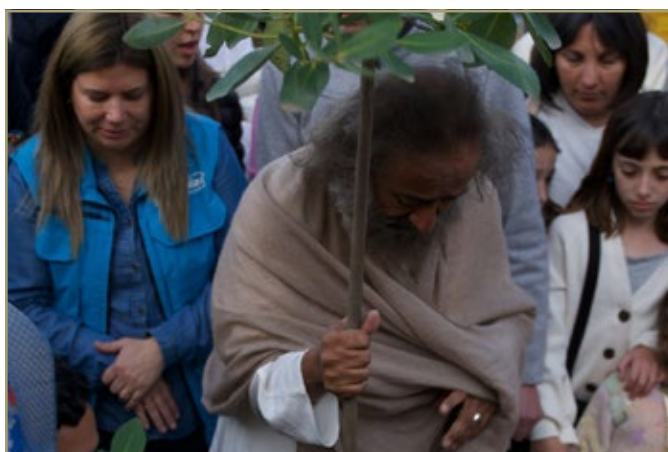
Gurudev was welcomed by the Mapuche community in La Pintana where he led the 'I Stand for Peace' event followed by tree plantation with traditional ceremonies | July 23