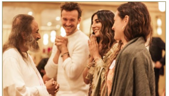
Interactions with various media personalities and podcasters | June 15