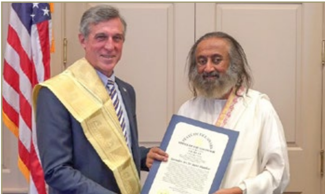
Governor John Carney, Delaware | May 10