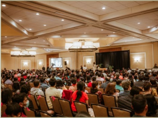
A celebration for peace and a pledge, New Jersey, USA | May 9