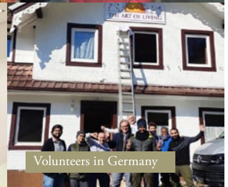
Volunteers in Germany