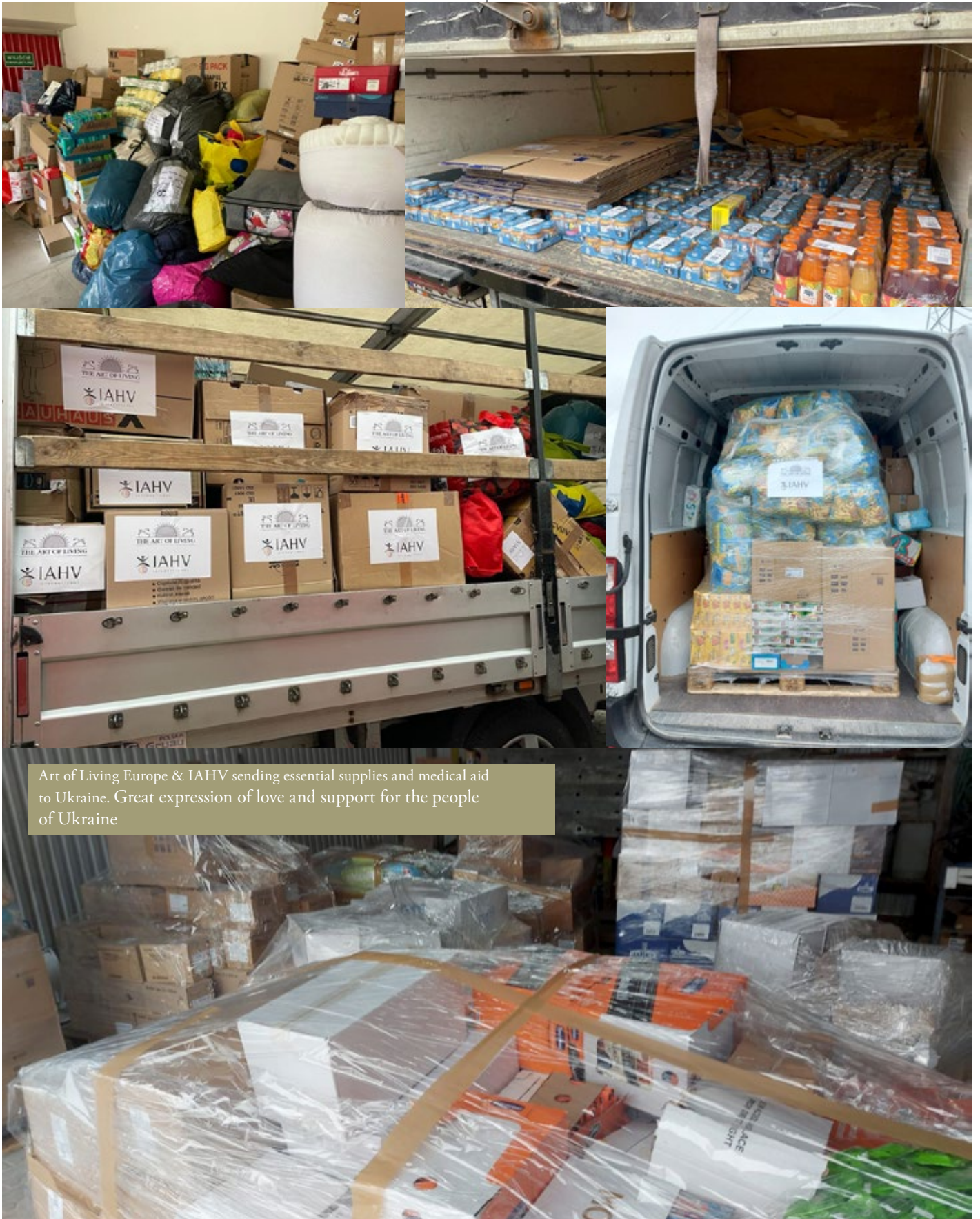
Art of Living Europe & IAHV sending essential supplies and medical aid to Ukraine. Great expression of love and support for the people of Ukraine