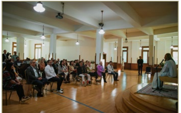
Interacting with business leaders and industrialists | June 1