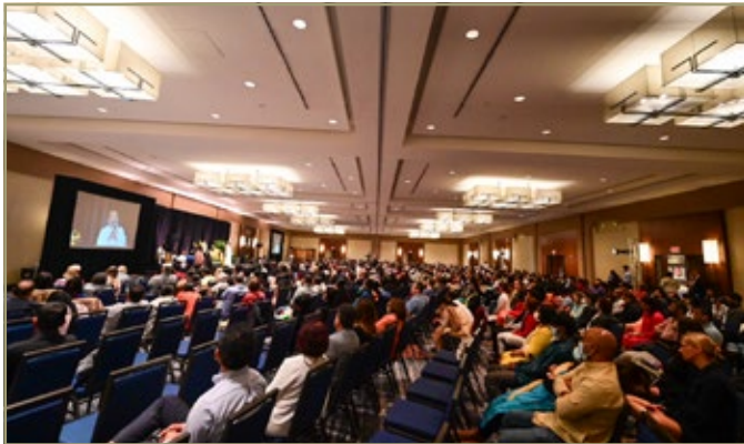
Hundreds take the pledge | May 7