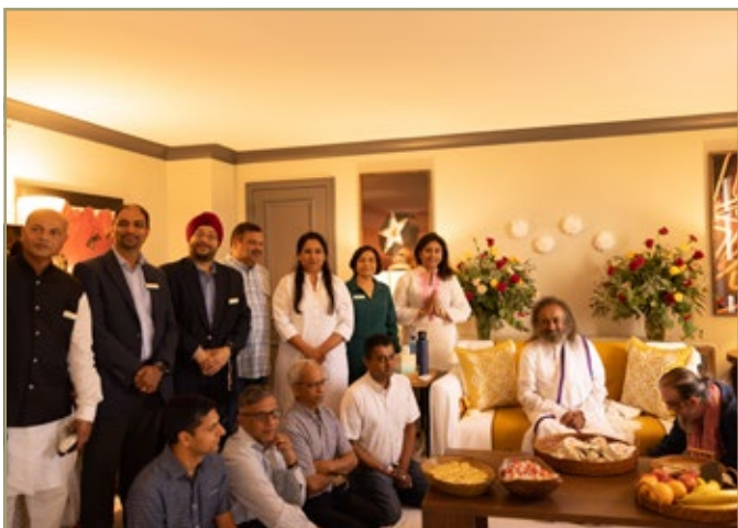
Community Leaders | May 19