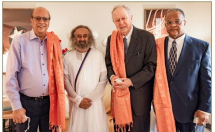
Judges | May 19