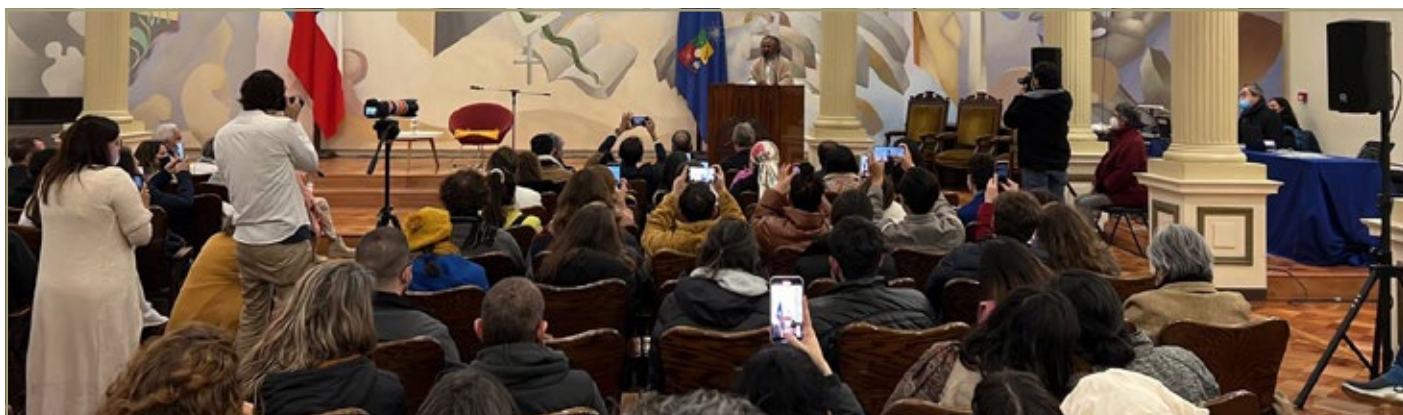
Gurudev addressed the rectors, faculty and students of the University of Chile | July 24