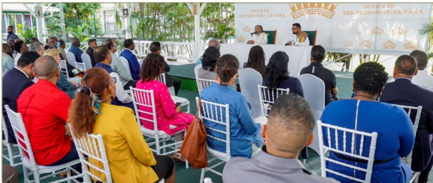
Gurudev was received in the State House by the President H.E. Mohamed Irfan Ali, the Prime Minister Hon. Mark Phillips, and several cabinet ministers | July 15

Gurudev was received in the State House of Guyana by President H.E. Mohamed Irfan Ali, the Prime Minister Hon. Mark Phillips, and several cabinet ministers. Diplomats from various countries were also present. They discussed mental health, agriculture, & Ayurveda. In the evening, he spoke and conducted mass meditation at the #I Stand For Peace event at the National Cultural Center. The Art of Living center in Guyana has been offering meditation and Sudarshan Kriya programs for the last 16 years.