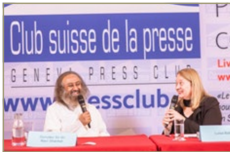
Interaction at the Press Club in Geneva