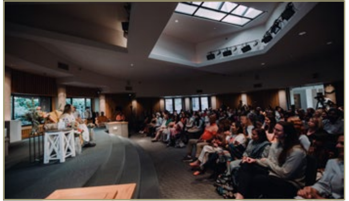
Arizona joins the I Stand For Peace movement Sedona | May 23