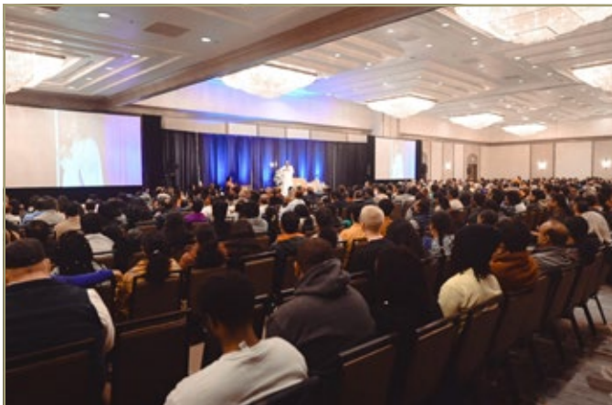
Thousands of people affirmed their commitment to inner and outer peace at the "I Stand For Peace" event in Memphis | November 29