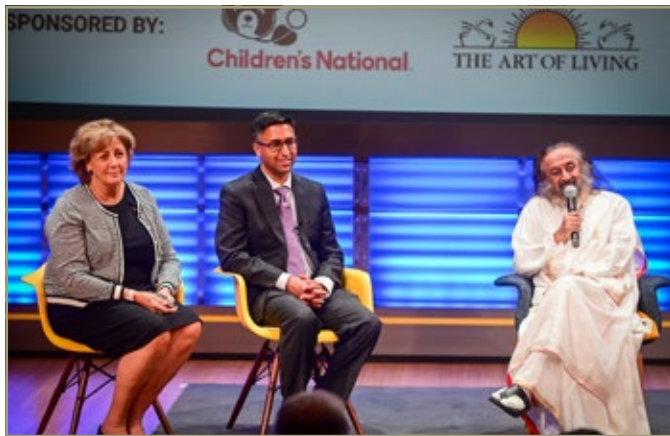
Honoring our Heroes: Prioritizing Health Care Workforce Well-being. Guest speaker at the National Geographic Auditorium | May 5