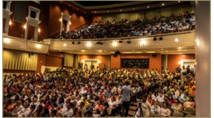
The “I Stand for Peace” movement was joined by thousands in Charlotte, NC, USA | July 8