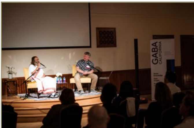
Addressing the German American Business Association | June 2