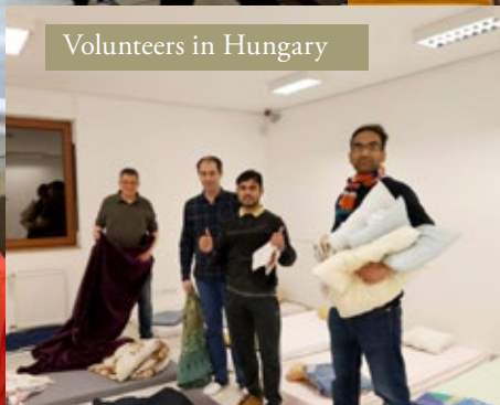
Volunteers in Hungary