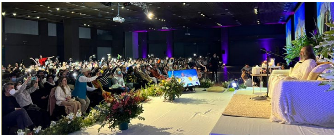
Thousands joined the 'I Stand for Peace' event with much love and enthusiasm | June 22