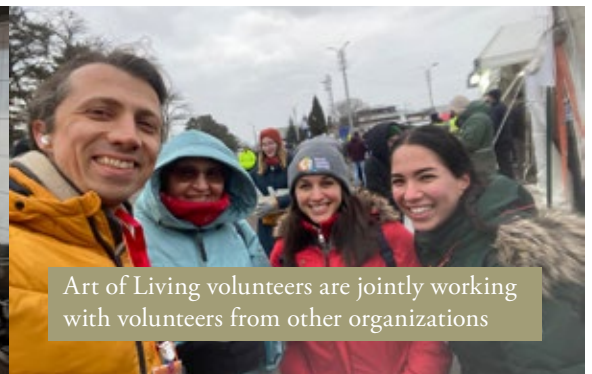
Art of Living volunteers are jointly working with volunteers from other organizations