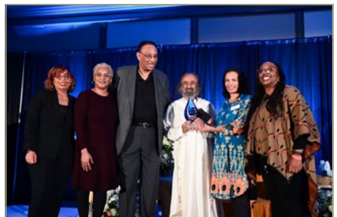
Gurudev being was bestowed with the "The Emissary of Peace" award by the National Civil Rights Museum in Memphis | November 29