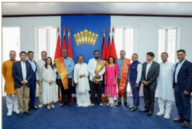
I Stand for Peace in Guyana was attended by thousand who meditated with Gurudev and pledged for peace | July 15