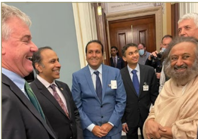
Interacting with members of Congress at Capitol Hill with Congressman David Trone and Congressman Raja Krishnamoorthi | May 12