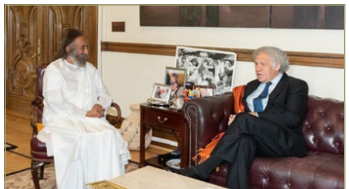
Meeting Luis Almagro, the Secretary General of Organization of American States (OAS) to discuss pressing issues concerning North and South America | May 12