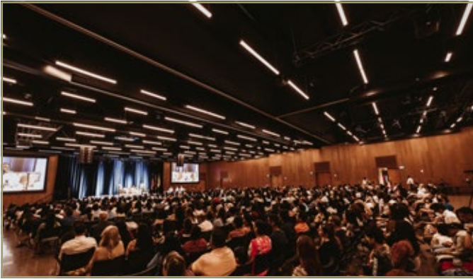
Phoenix | May 23