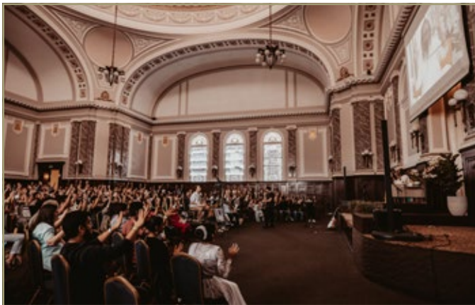
An interaction with students of University of Southern California | June 1