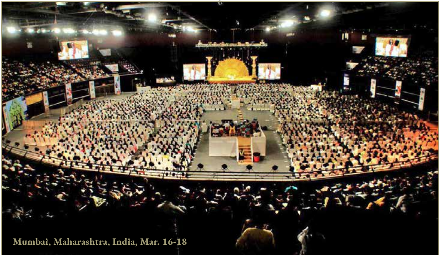
Mumbai, Maharashtra, India, Mar. 16-18