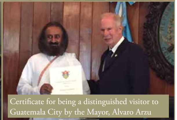
Certificate for being a distinguished visitor to Guatemala City by the Mayor, Alvaro Arzu