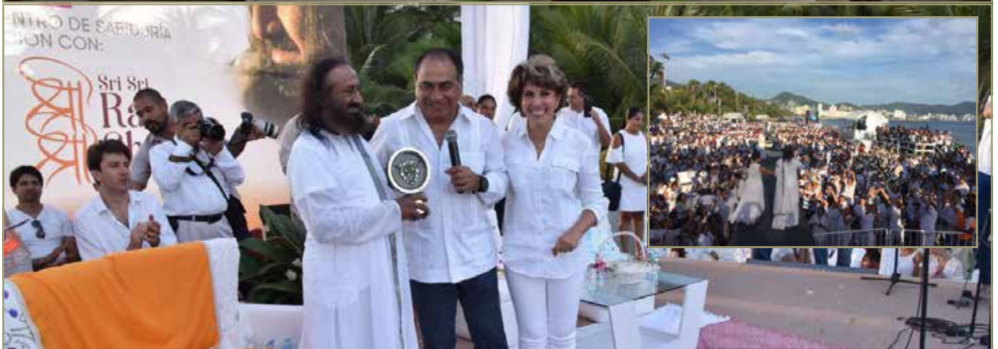
Gurudev received the Ambassador of Peace Award, Acapulco, Mexico