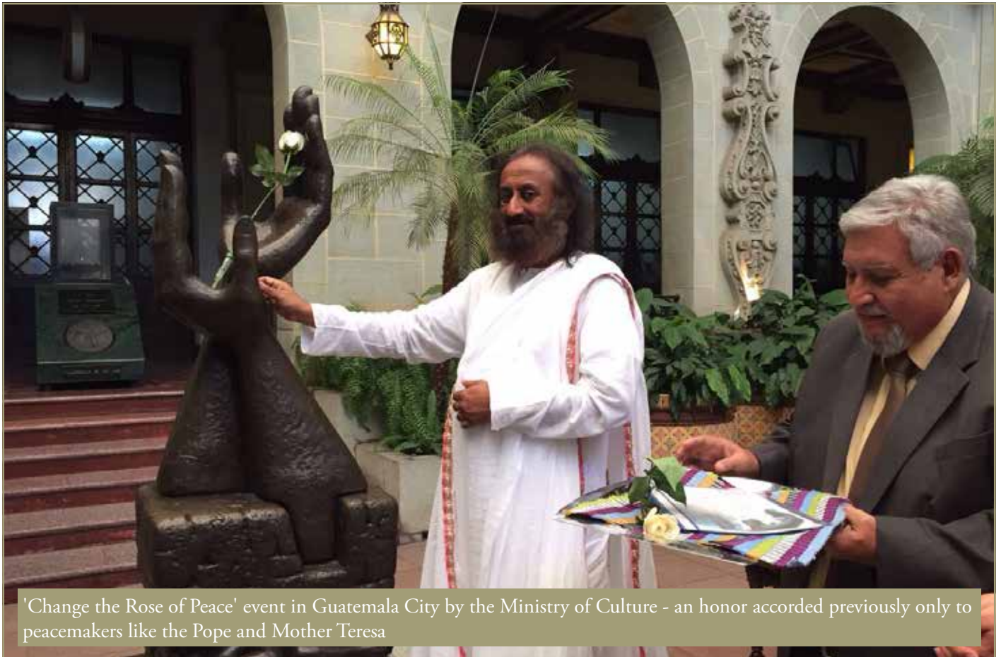
'Change the Rose of Peace' event in Guatemala City by the Ministry of Culture - an honor accorded previously only to peacemakers like the Pope and Mother Teresa