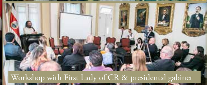
Workshop with First Lady of CR & presidential cabinet