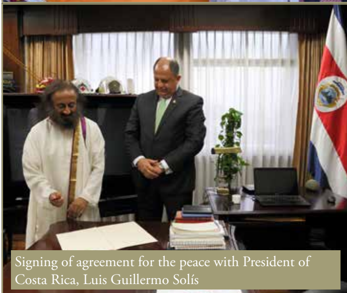
Signing of agreement for the peace with President of Costa Rica, Luis Guillermo Solís