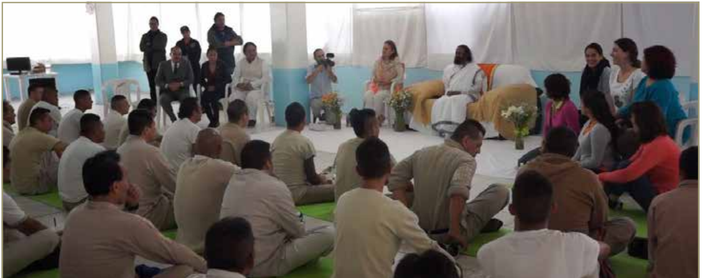
Gurudev addresses inmates of the second largest & most violent prison in Mexico City, Reclusorio Varonil Norte