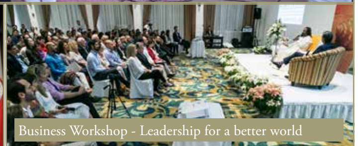
Business Workshop - Leadership for a better world